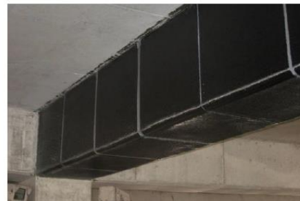
Figure No. 3 Carbon FRP fiber installation

Composite wraps or carbon fiber jackets are used for reinforcing and adding ductility to reinforced concrete and maceration components without any penetration. Composite wraps on reinforced concrete columns are most effective Additional containment provided.