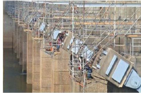
Figure No. 2 External Post Tensioning to restore or increase capacity