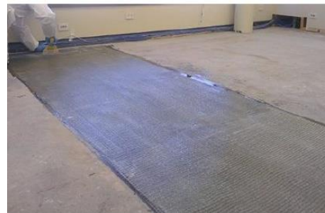
Figure No. 4 FRP Composite Strengthening services Concrete solutions